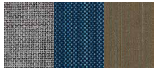
PEBBLE GREY PORCELAIN STONE*