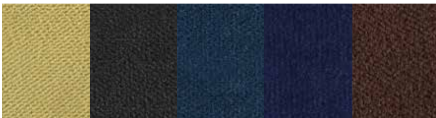
CITRUS DARK GREY HARBOR LAPIS MAHOGANY