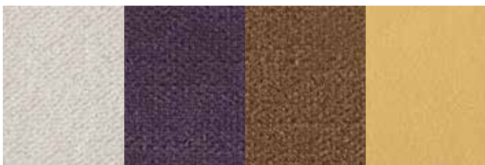
SNOW THISTLE TOAST TURMERIC