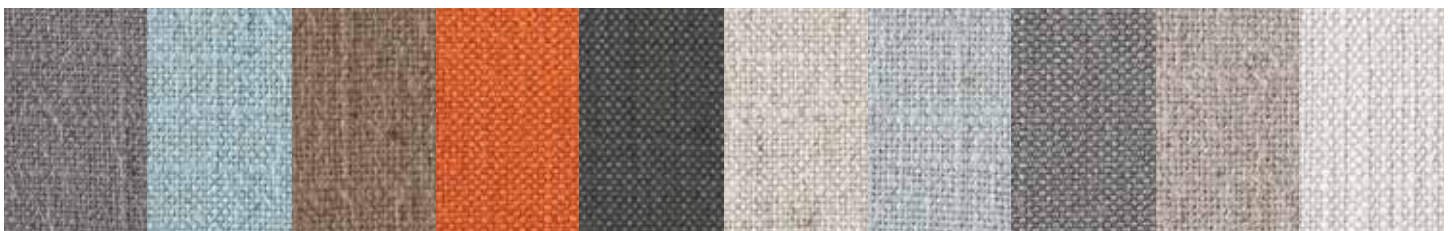
CHARCOAL GLACIER MALT MANDARIN MOONSTONE NATURAL OCEAN PUTTY STEEL WHITE

NOTES: Visit our website or price list for COM yardage requirements for various items. Please know that this fabric summary is for guidance only, and should not be used for ordering or precise colour matches. Fabric swatches are available upon request to authorized dealers.