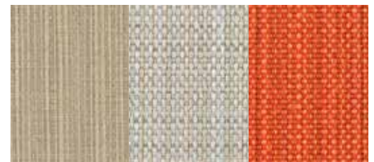
DOVE* ECRU FLAME