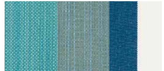
AQUA CELESTE* CUBAN REGATTA*