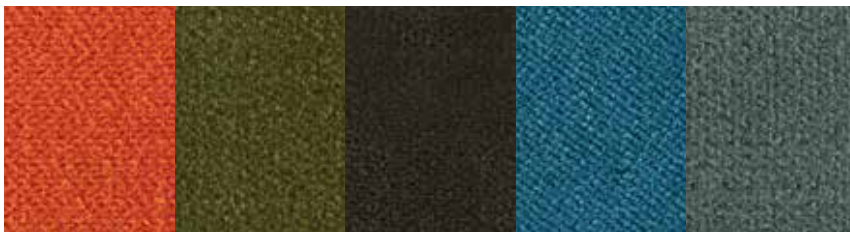
MARMALADE MIDORI MOSS PRUSSIAN SILVER SAGE